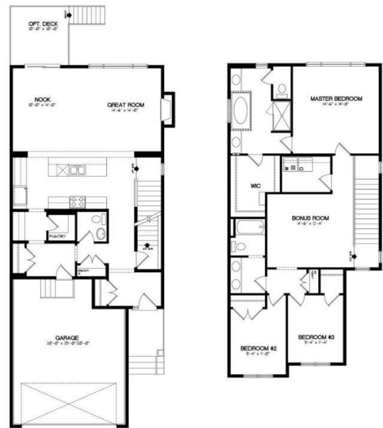
MAIN FLOOR - 997 SQFT

Interior Features Double Vanity, Granite Countertops, Pet Animal Home, No Smoking, Walk-in Closets, Lighting, Soaking Tub, Walk-in Pantry Appliances Dishwasher, Garage Control Heating Forced Air Cooling None Fireplace Yes # of Fireplaces 1 Fireplaces Gas, Great Room Has Basement Yes Basement Full, Unfinished