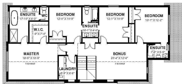
SECOND 1,546 SQ.FT.