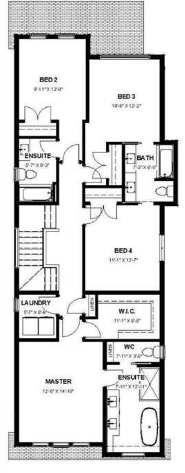
SECOND 1,245 SQ.FT. (4 BEDROOM OPTION)

Listing Office Real Estate Professionals Inc.